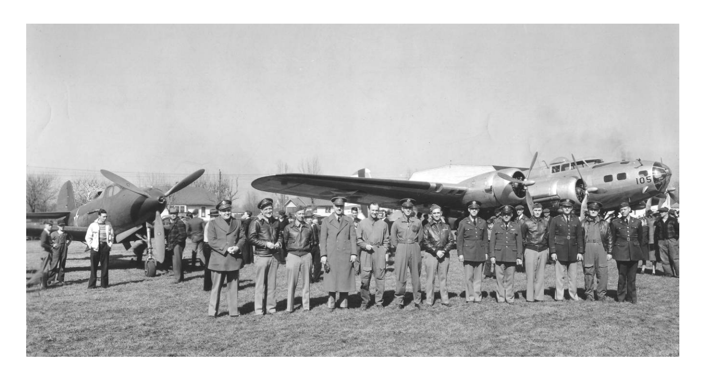
A B-17 and an AirCobra at Cox Field in Terre Haute in 1941