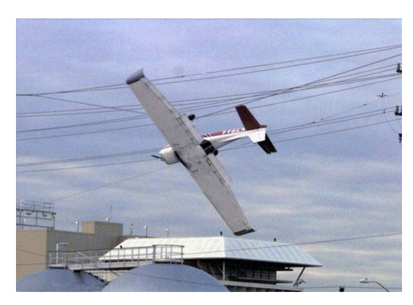
This is NOT what is meant by Arresting Cables...