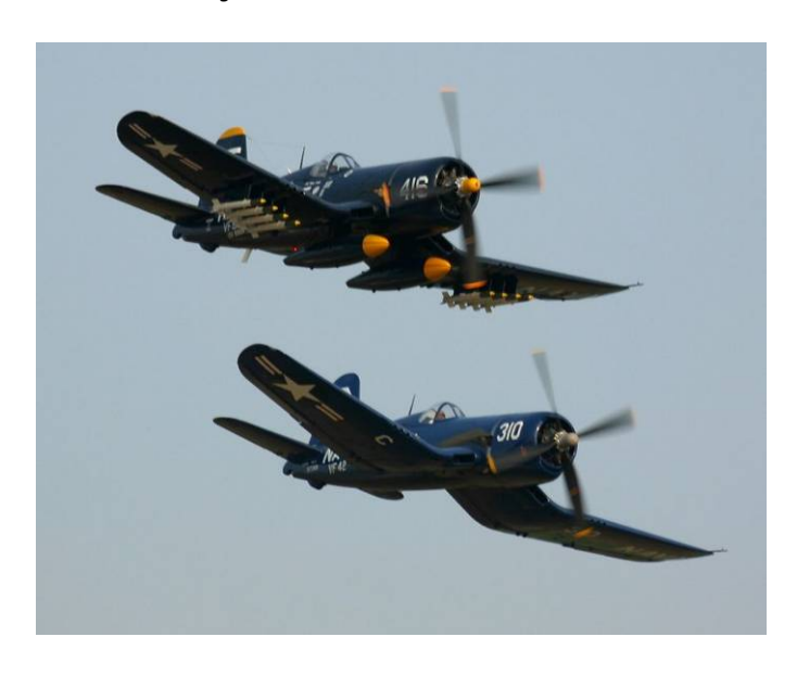
You just don't see this every day...