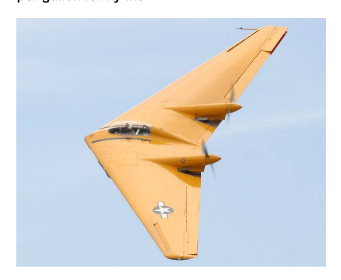
This is a picture of one of the original Northrop Flying Wing, twin engine, prototypes, N9MB