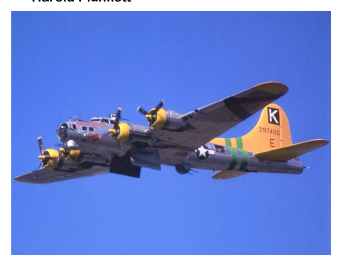
Fuddy Duddy on a Bombing Run...