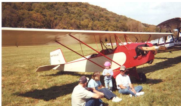
A Pietenpol Air Camper at Lee Bottom