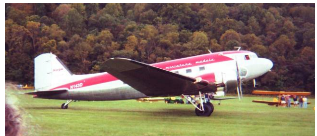
The DC-3 taxiing at Lee Bottom

Answer: The annual Lee Bottom Fly In just south of Madison, Indiana.