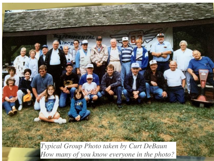
Typical Group Photo How many of you know everyone in the photo?