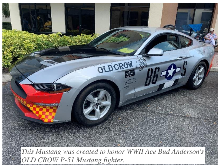
This Mustang was created to honor WWII Ace Bud Anderson's OLD CROW P-51 Mustang fighter.