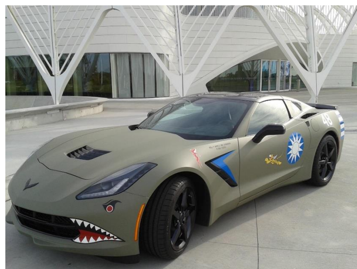
This Corvette is styled in honor of the Flying Tigers of WWII