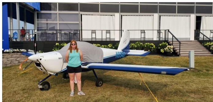
Now this is more like it.

decided she was going to get her pilot's license one way or another sometime in the near future.