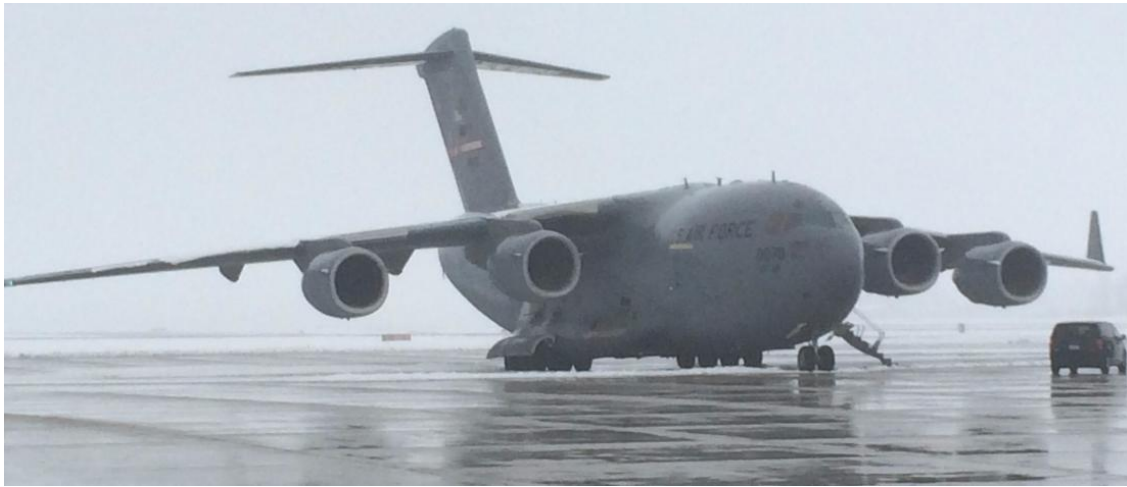
Sometimes the weather in Terre Haute grounds the biggest of us.