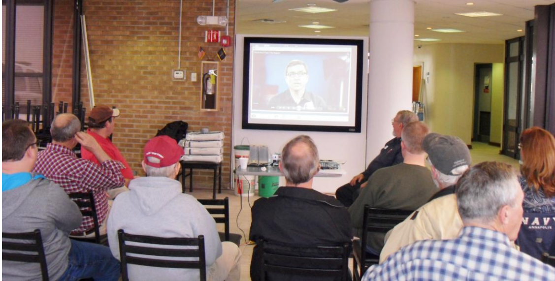
Members watch an AOPA Chapter video during meeting prior to discussing the 2015 meeting and fly-out schedule.