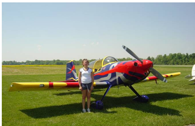
Wild Child with a nice Super 8