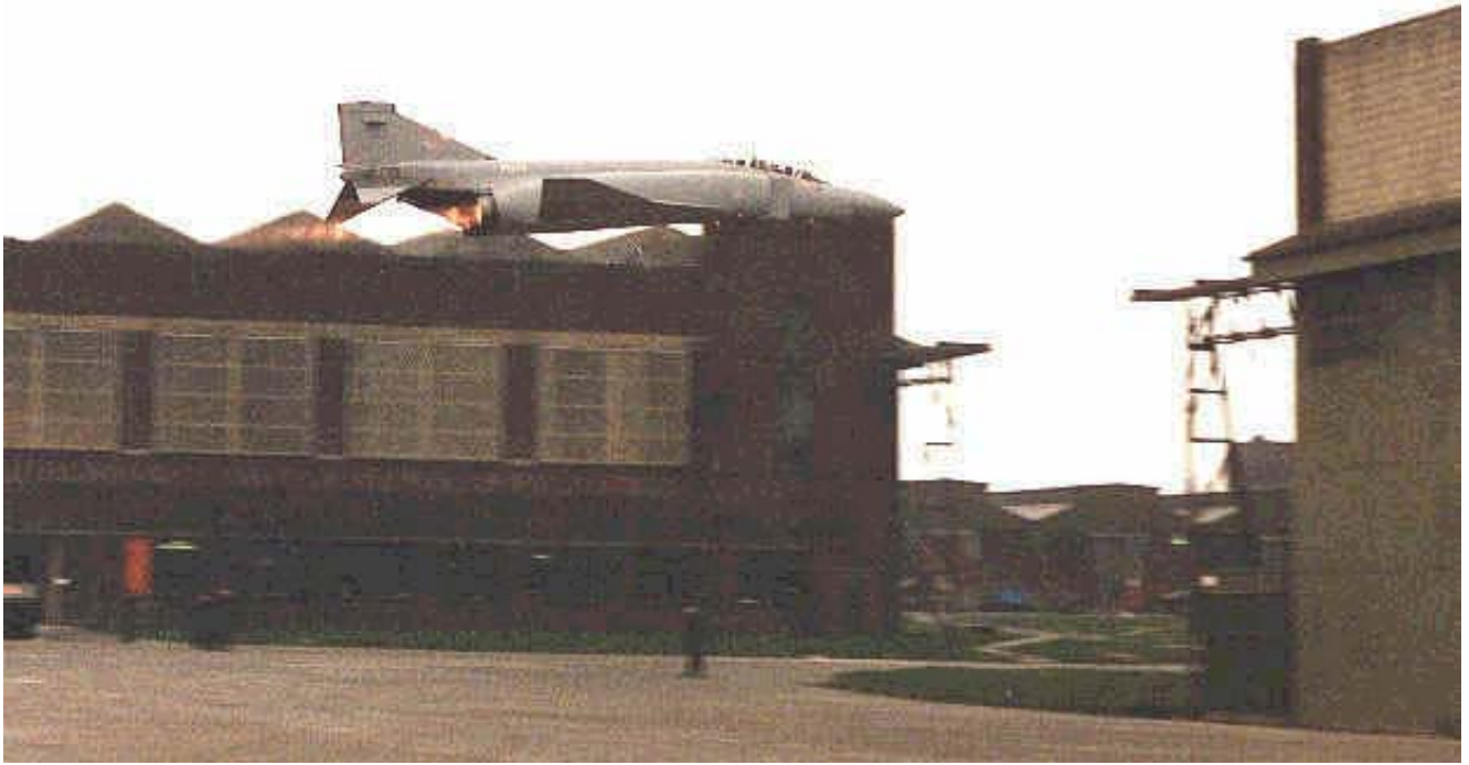
Now this is a low pass...