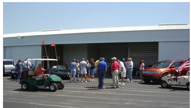
The Food Hangar at Sullivan surrounded by people and new cars.

May 8, 2004 - Sullivan county Airport What a meeting! They don't get any better than this one. 54 people attended and they arrived in 26 aircraft. Tied at the top of the list of aircraft were RVs with 8 and Cessna also with 8. There were also 3 Pipers, 3 Super Decathlons/Citabrias, 1 Mooney, 1 Longeze, 1 Spacewalker, and 1 Zodiac. Then to make it a Fly-in/Drive-in, Dennis Meng brought 8 brand new cars with him from Sycamore Chevy. And some very cool cars they were including a new black Corvette, a new Chevy SSR supercool truck, and a nice collection of Nissan's with their new 1/2 ton pickup and a 265 hp Maxima SE.