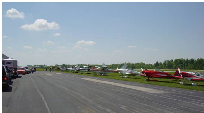
Part of the Flight Line at SIV. Look at that Blue Sky...