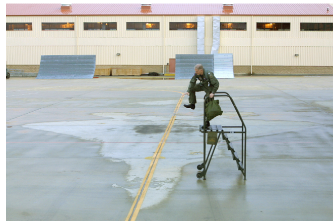
Climbing aboard the new F-22 Stealth Fighter

Sunday, June 6, Olney-Noble Airport, OLY, 60 nm from HUF @ 223, Spring breakfast fly in by Olney-Noble pilots assn. Starts at 8 am.