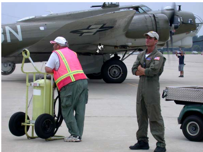
Airdales doing what they do best