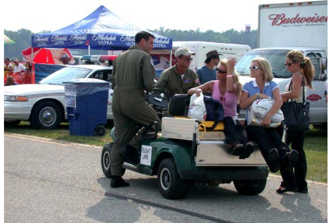
Airdales on point