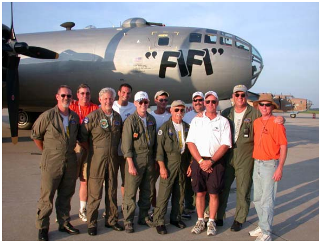
Airdales and Ramp Rats with the B-29.