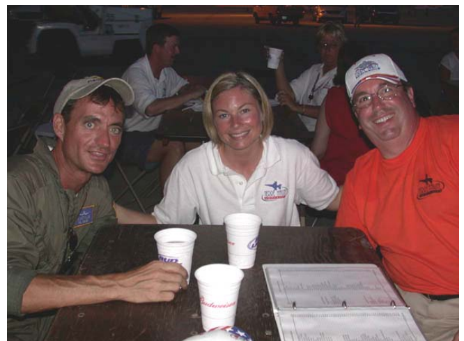
Three people – Six glassy eyes...