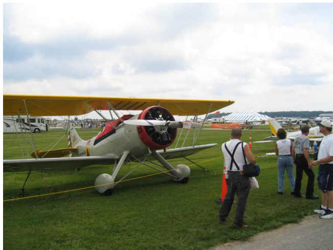
Tom Flock's latest creation on our EAA flight line