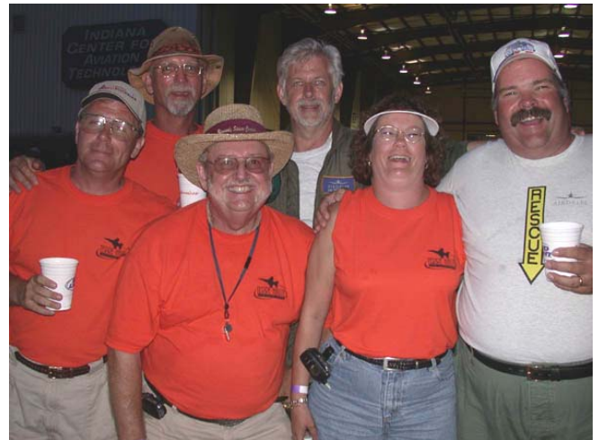
Surviving the Survivor Party