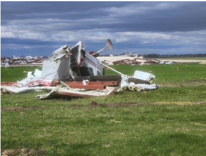
The ground photos are courtesy of storm chaser Jeff Wallace

Please keep your thought and prayers with them during this most difficult time. It is hoped that both ours and Chapter 41 will get together to offer assistance at some point.