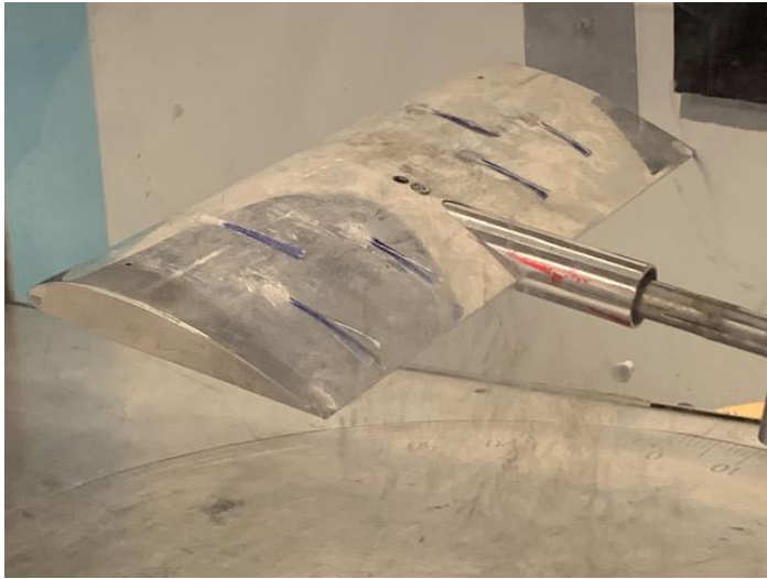
Tuft's showing clean airflow across the wing