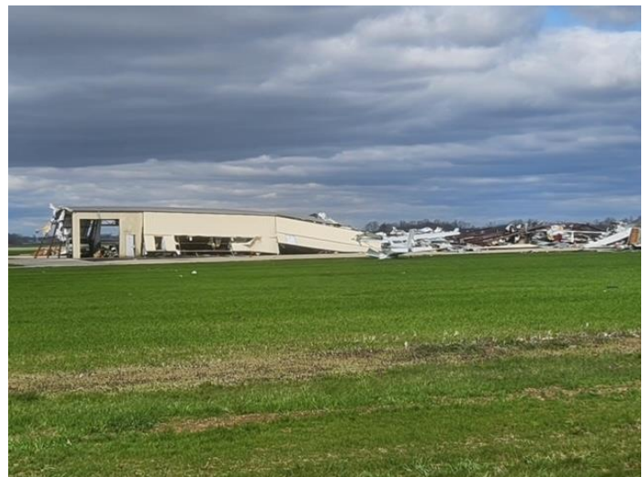
This photo was taken East of the T-hangars.