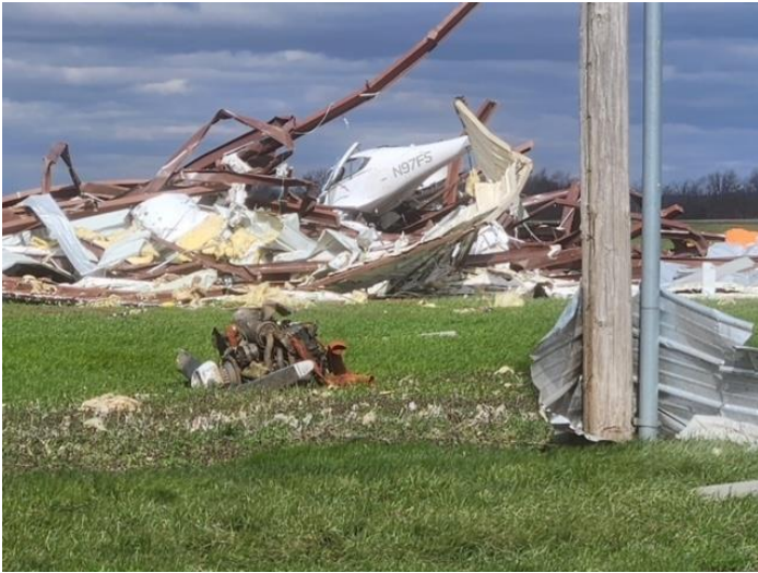
Closeups of some of the destruction