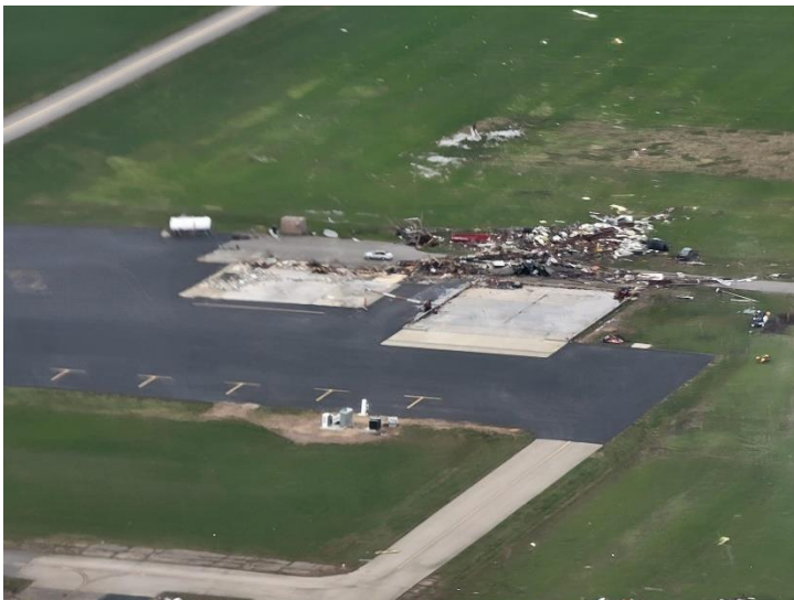
Photo showing the FBO, Maintenance and Large Hangar. Both completely removed from their foundations.

I begin this newsletter with a very sad report on the tornado that tore through the Robinson Airport, KRSV, on 31 March. As the photos will show the airport suffered a major loss. All buildings, hangars, equipment and aircraft were destroyed in the storm. Their home, only a few hundred yards away was miraculously missed.