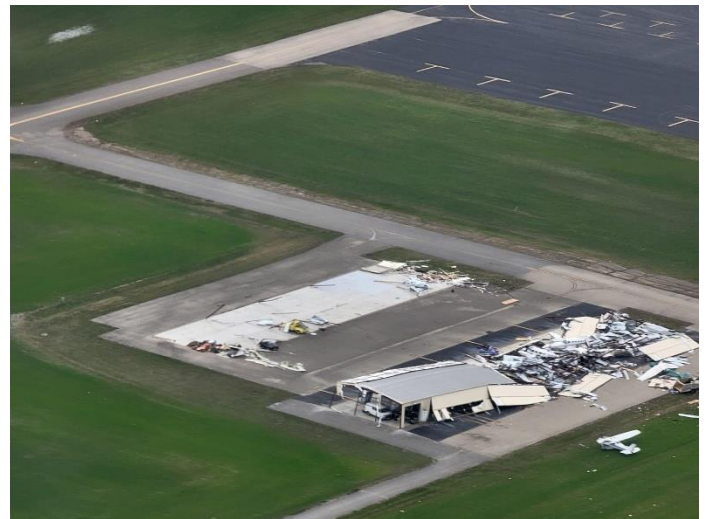
Photo showing the T-Hangars with the left T-hanger moved off its foundation and against the right T-Hanger. The two aerial photos are courtesy of Elliot Abel.