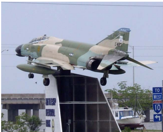
Here is an F-4 on a stick at Battleship Park