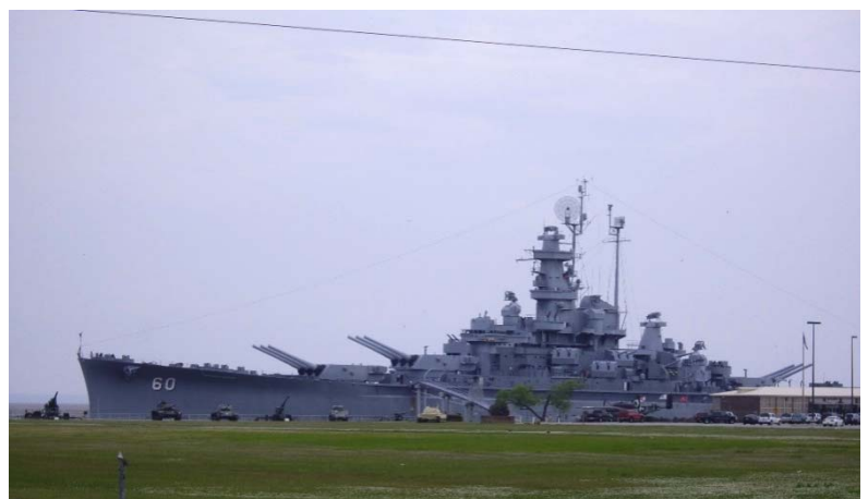
And here is the USS Alabama in Mobile Bay. It's a great tour if you ever get the chance to visit.